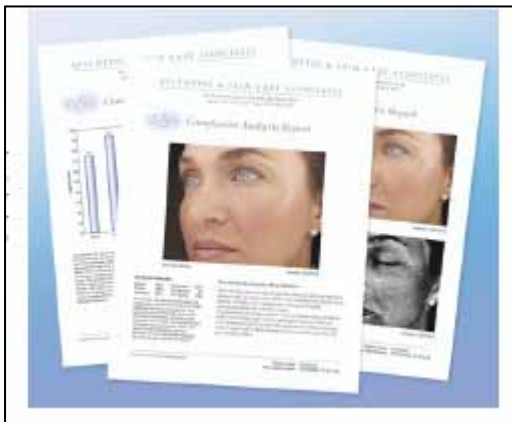
Figure 3. Your personalized VISIA™ complexion analysis incorporates specific comments and recommendations by Dr. Harvey and staff.